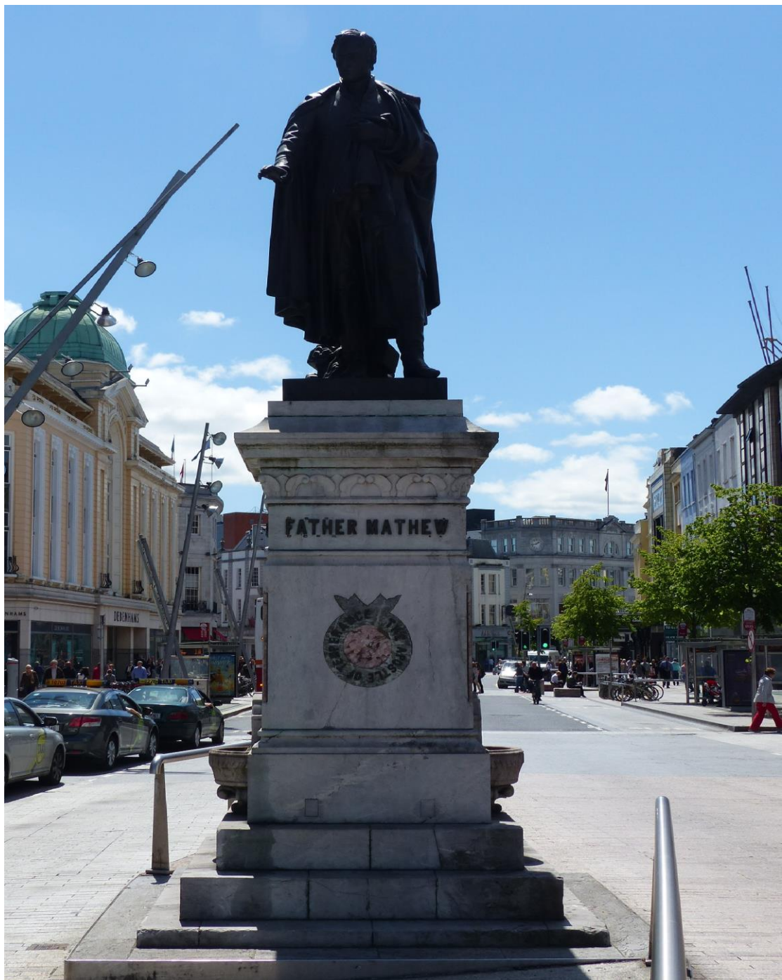
Fig. 5. North side of the statue, prior to works.