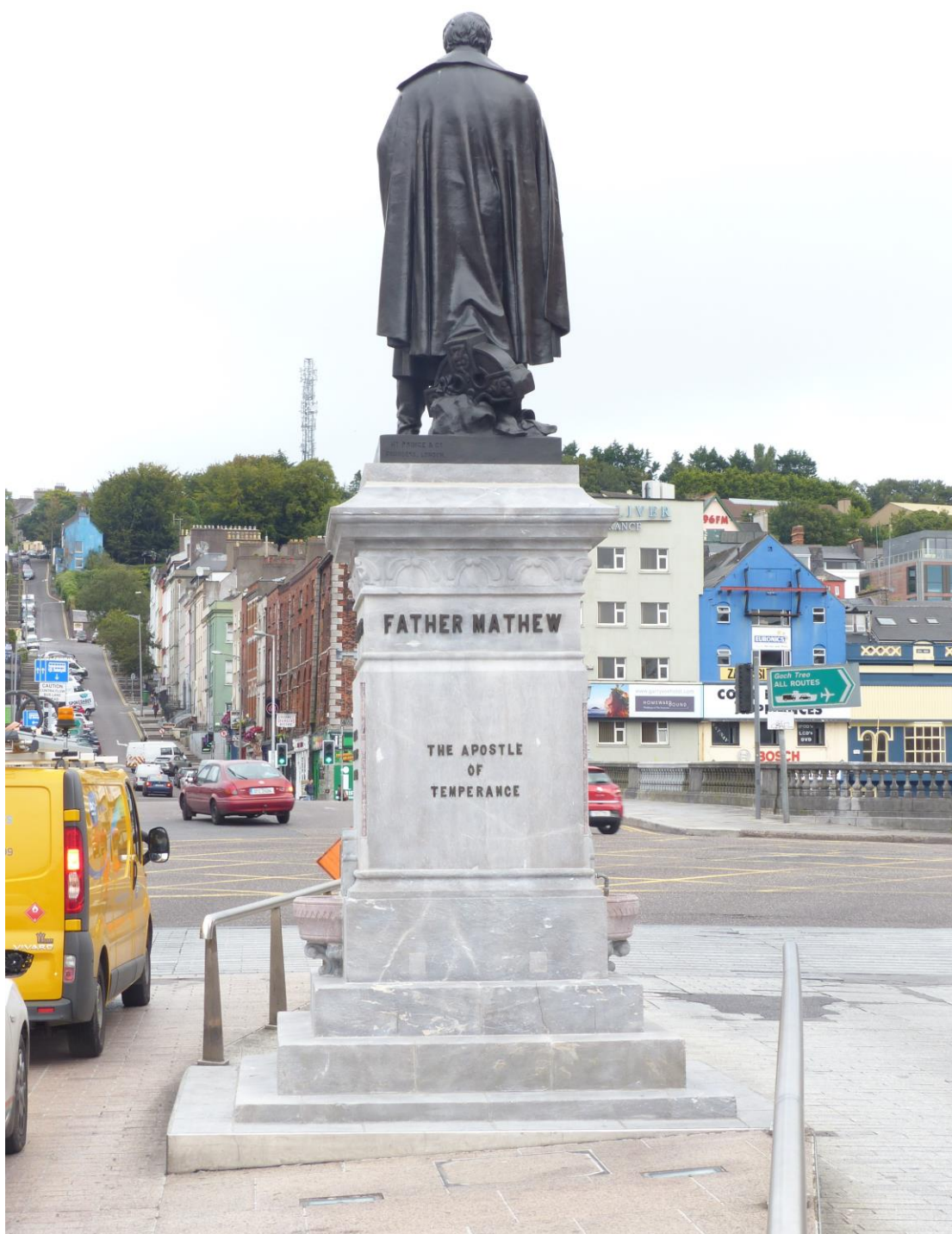
Fig. 10. South side of the statue, after works.