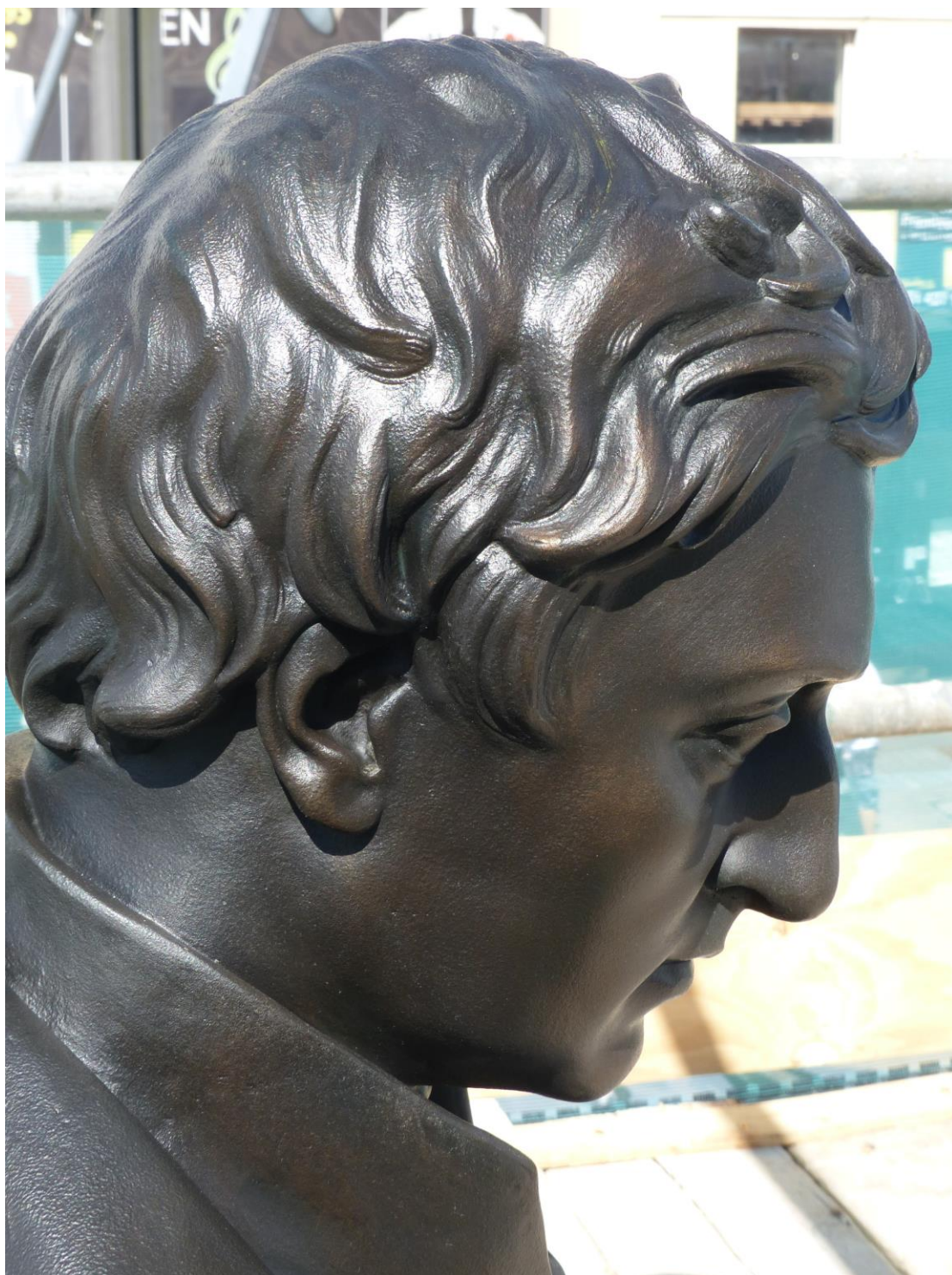
Fig. 4. Detail of the statue, after works.