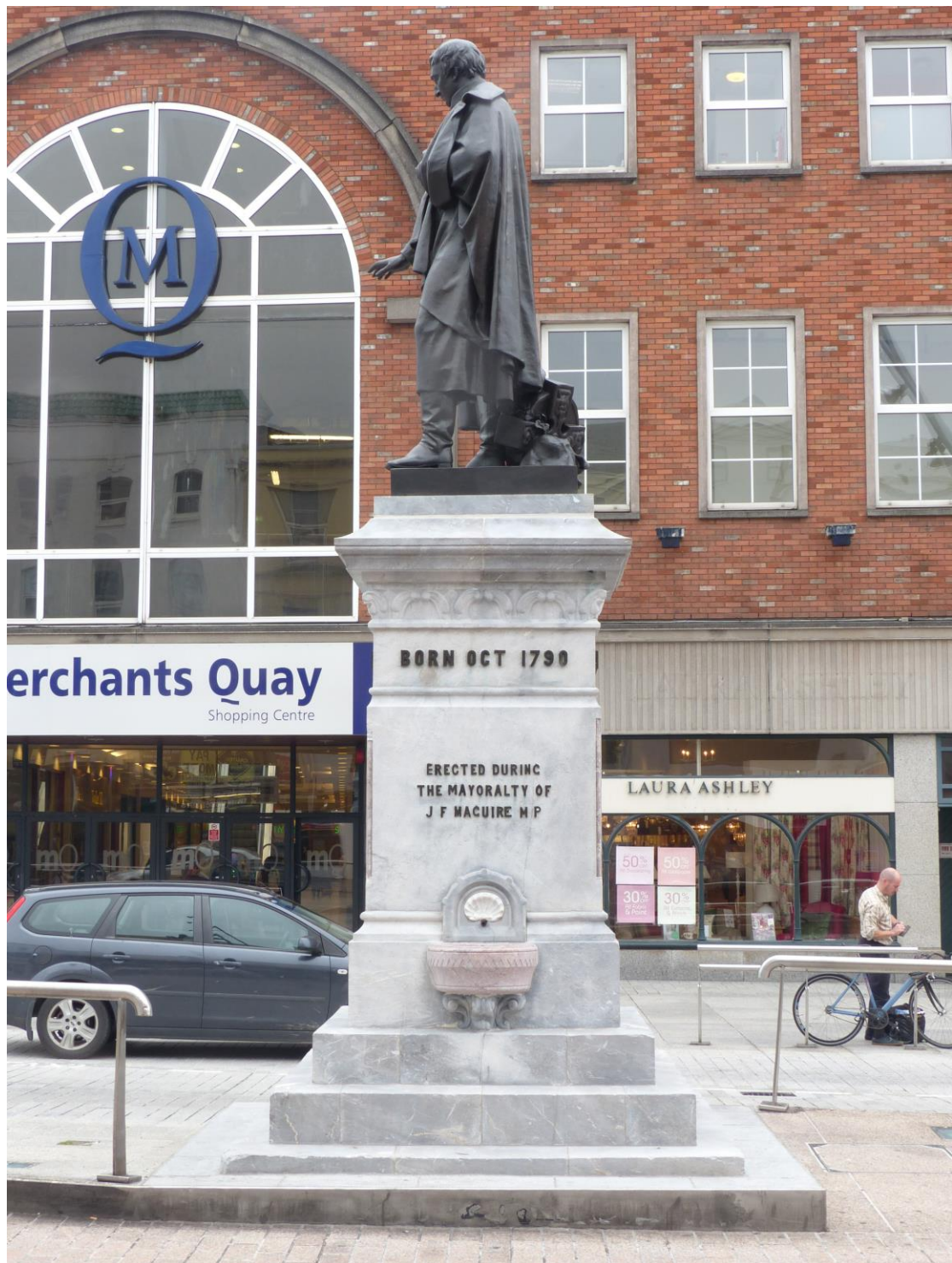
Fig. 8. West side of the statue, after works.