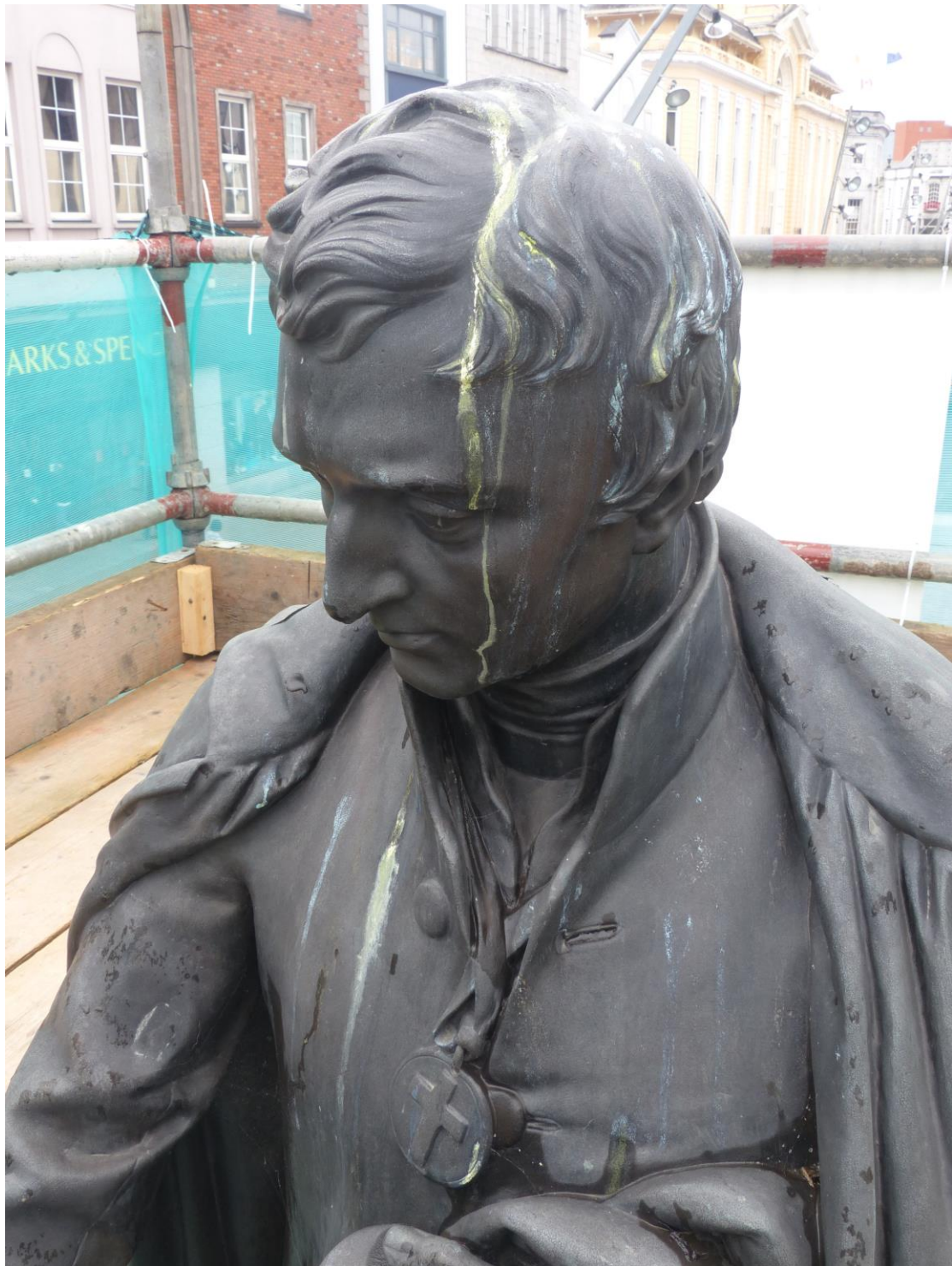
Fig. 1. Detail of the statue, prior to works.