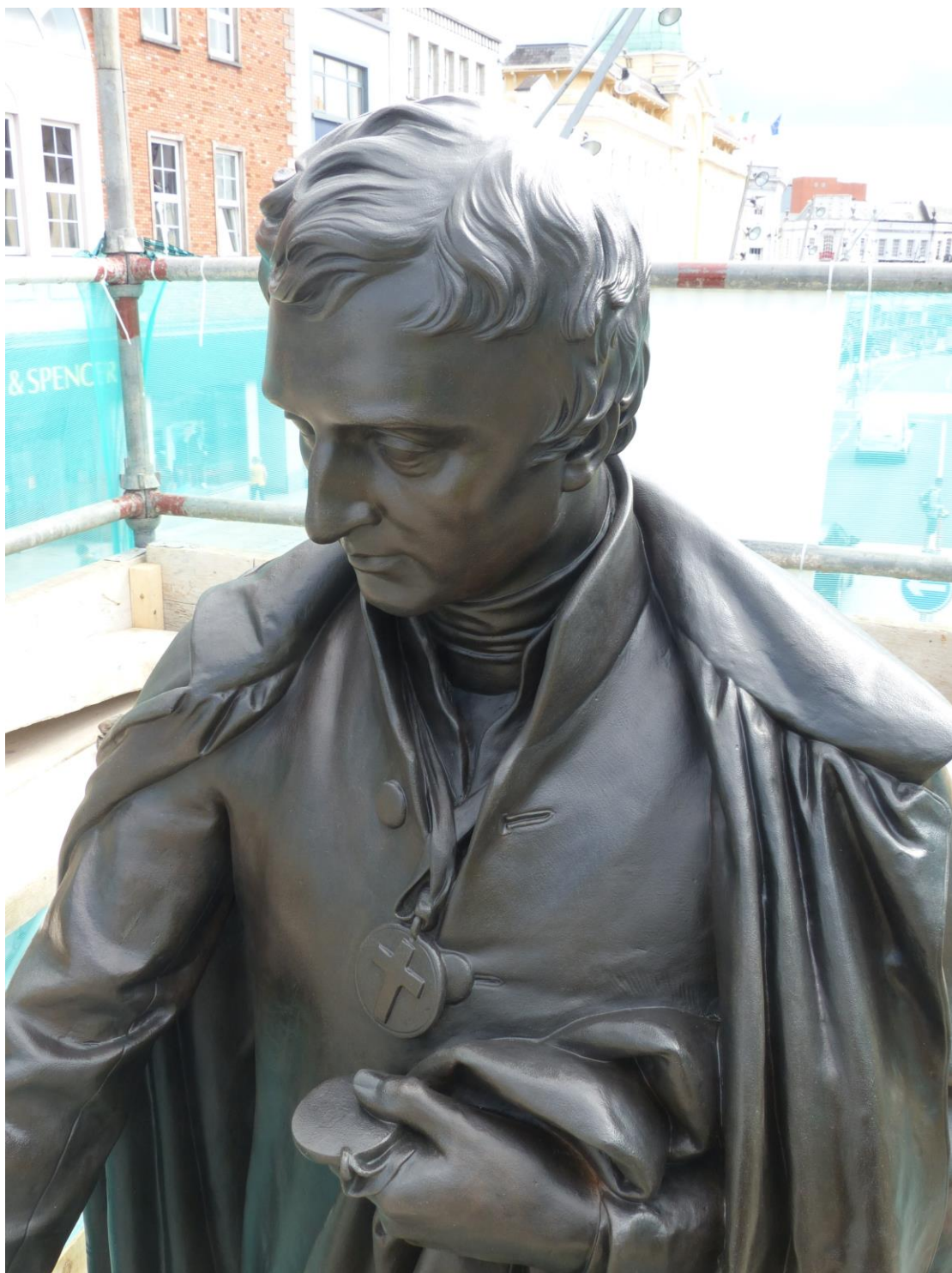
Fig. 2. Detail of the statue, after works.