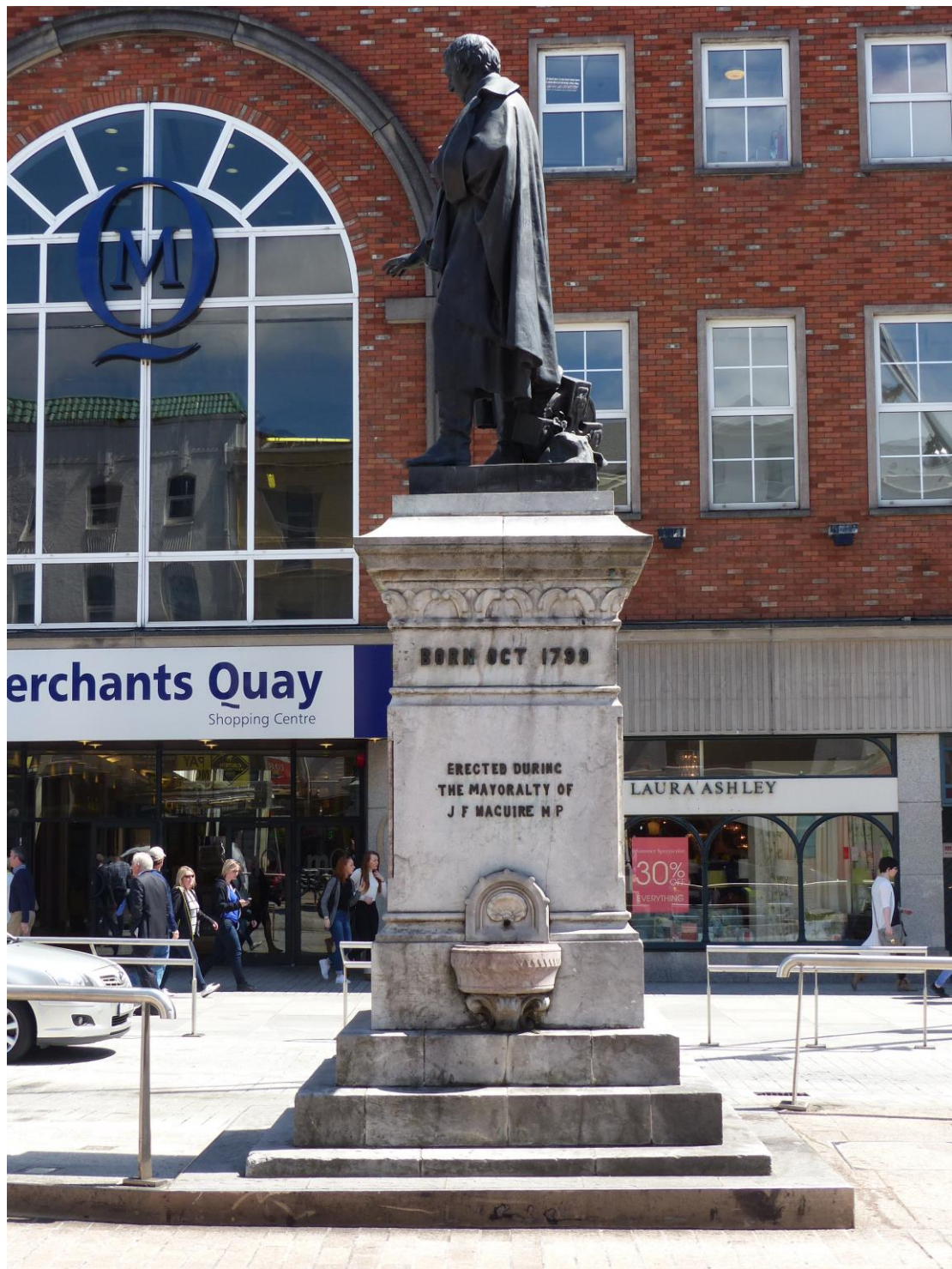
Fig. 7. West side of the statue, prior to works.