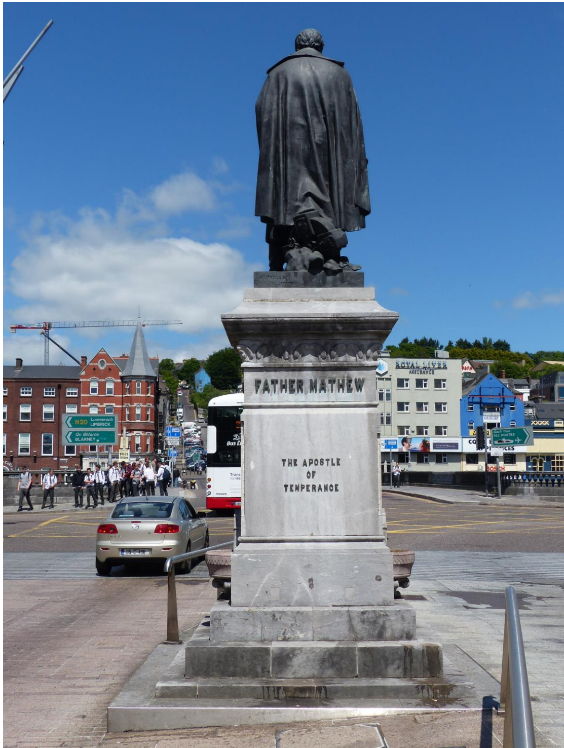
Fig. 9. South side of the statue, prior to works.