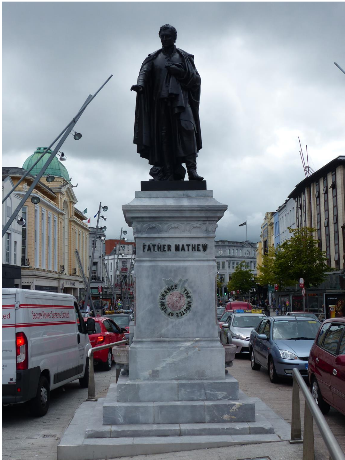
Fig. 6. North side of the statue, after works.