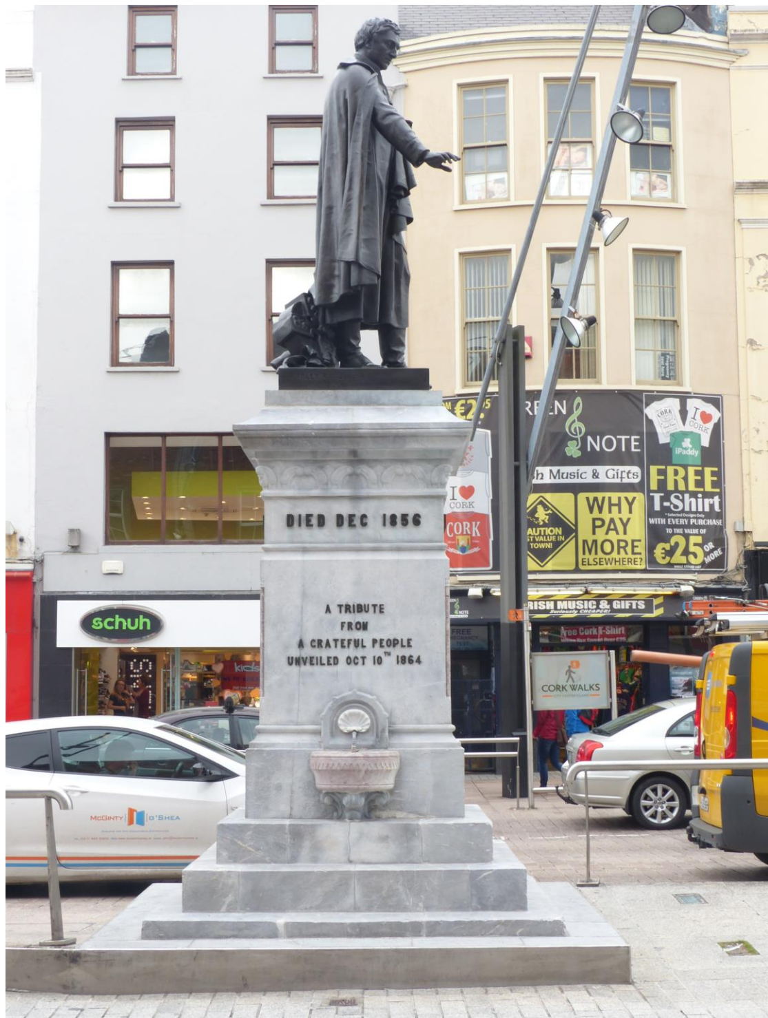
Fig. 12. East side of the statue, after works.