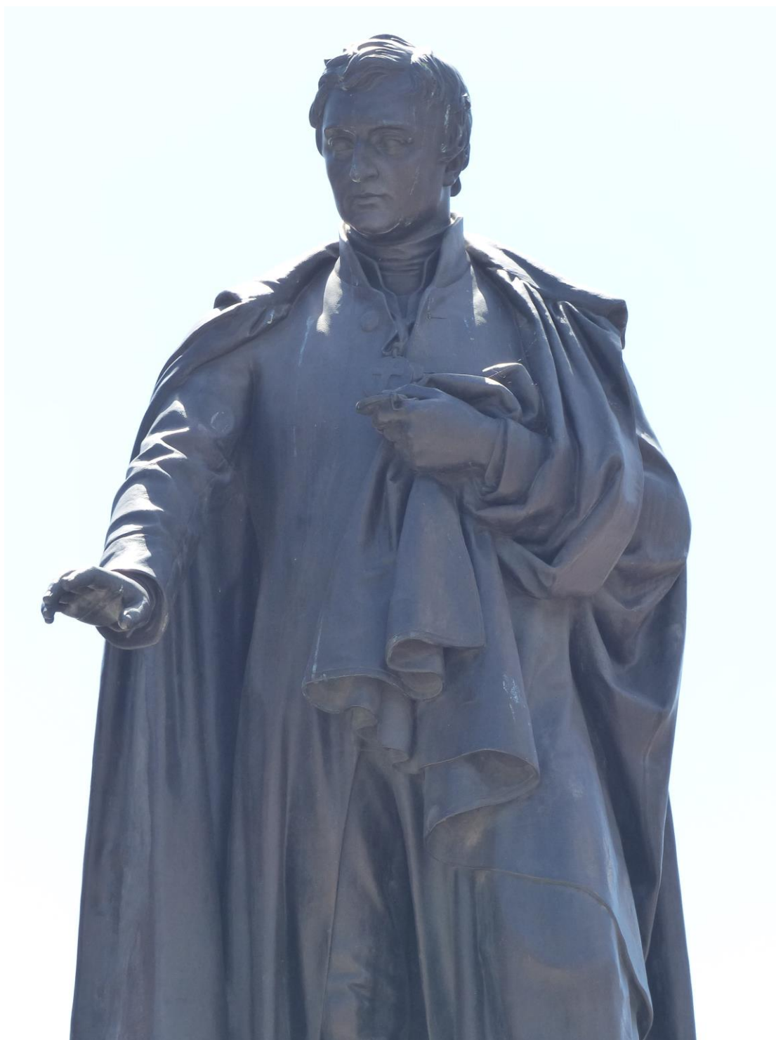
Fig. 13. Detail of the statue, prior to works.