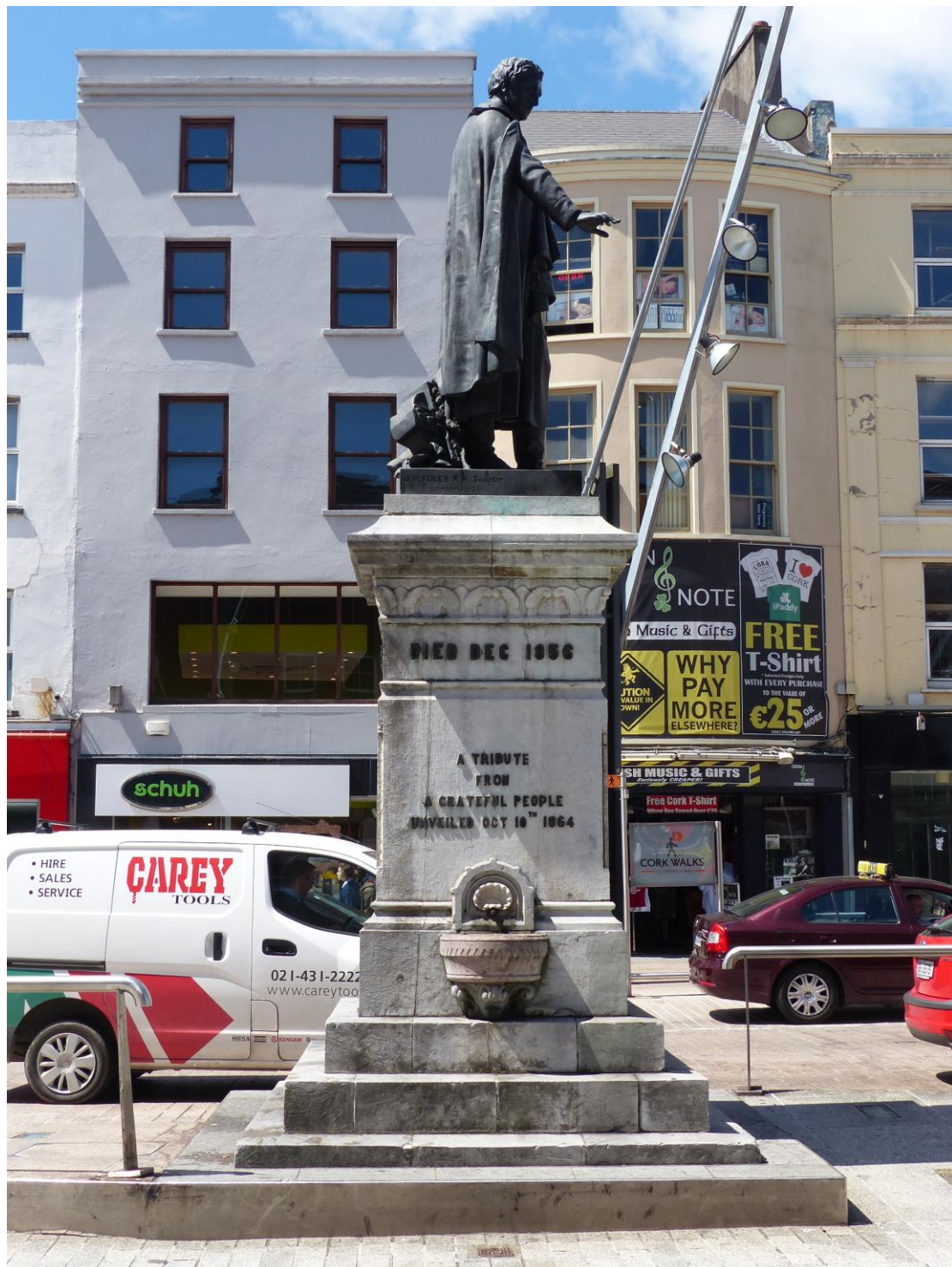
Fig. 11. East side of the statue, prior to works.