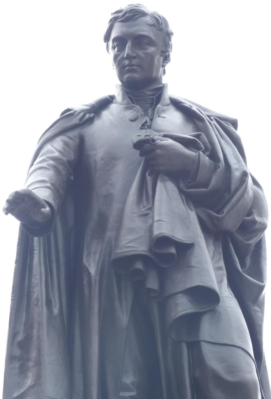
Fig. 14. Detail of the statue, after works.